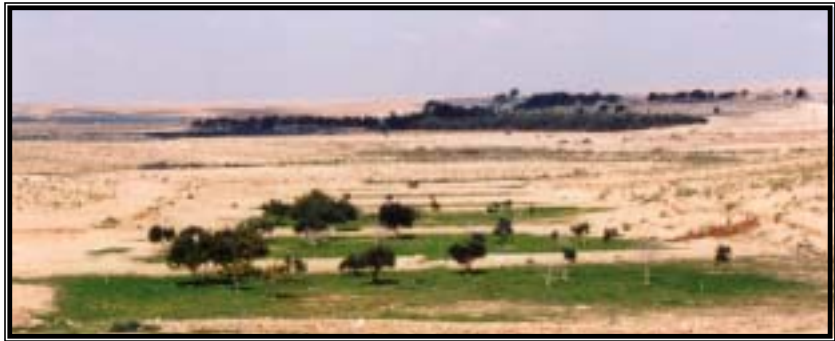
A farm from the Byzantine Period, 5-7 th Century C.E., restored by the Jewish National Fund

Modern Dryland Agroforestry: Since a component of my studies at the U of A is dryland agroforestry, I was excited to observe many different forms of agroforestry in the Negev Desert. For example, I saw restored terraces (i.e., the walls rebuilt and trees planted) used for both educational and scientific purposes. While traveling by bike, car, and bus through the Negev, I also saw small forests irrigated with brackish water and areas planted by Bedouins. With each of these agroforestry sites, I clearly saw the watershed system that enabled vegetation to grow despite the arid climate.