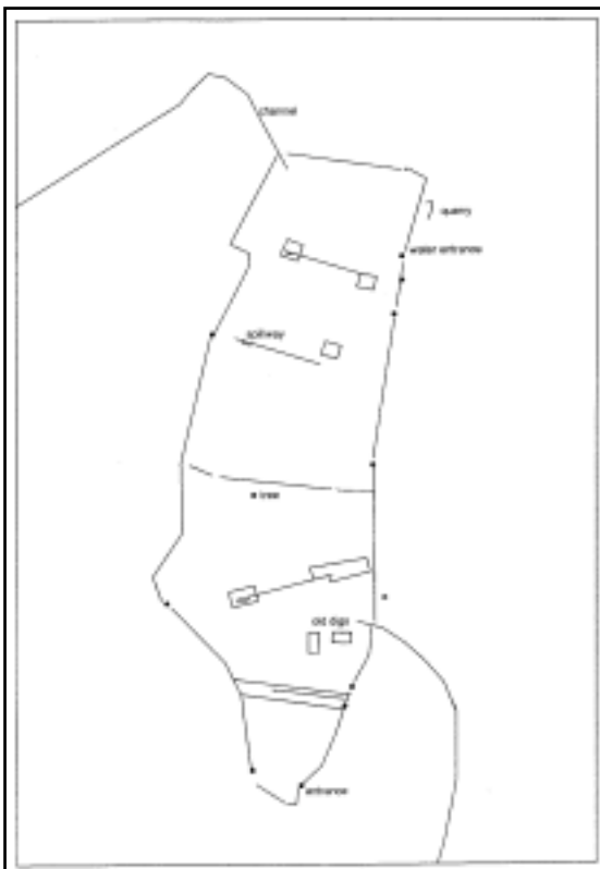
Map of an ancient terrace found near Nitzana